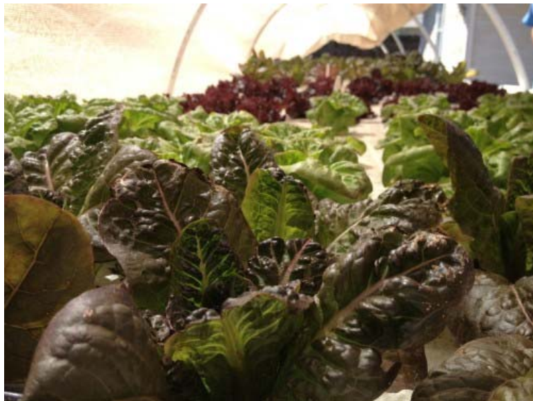
From Cultivate LA (Photo: Kelly Rytel)