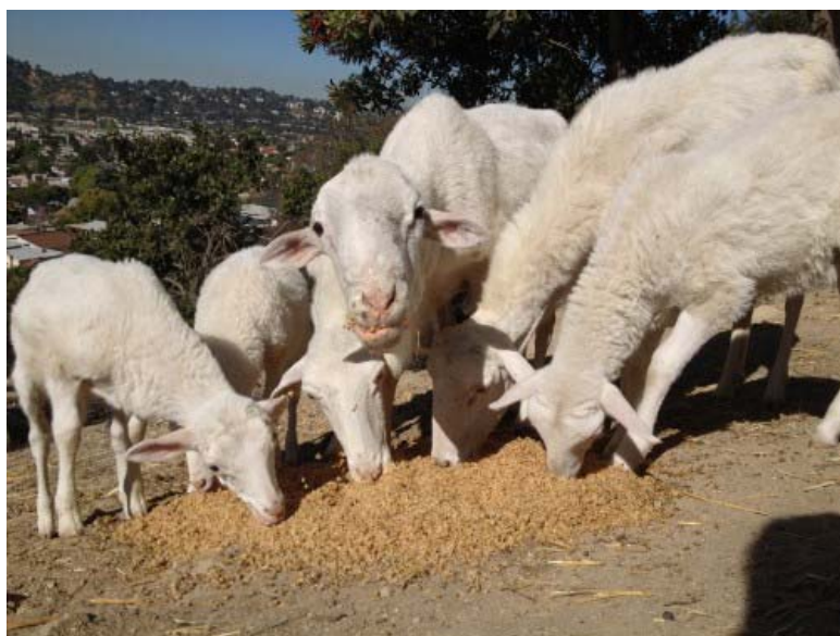
Cultivate LA